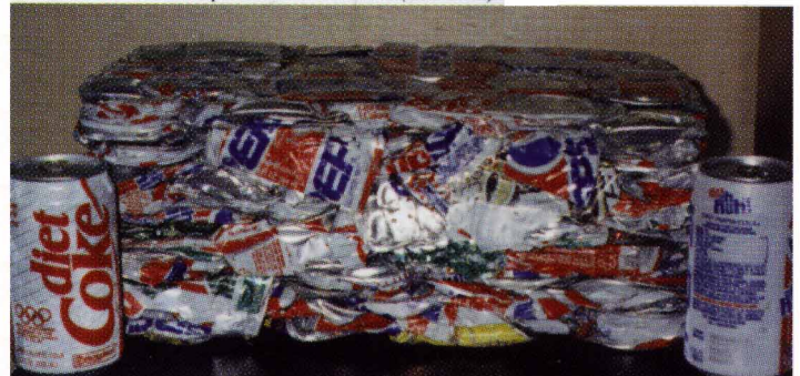
Densified Block - 900 plus Aluminum Cans (20P cube)